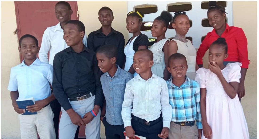
Some of the Kids From Harry's Home, the Future of Haiti.

Why? In order for there to be enough perceived value in education to justify the required sacrifice, there must be hope. The greatest source of hope I know of is reflected in John 8:36 – So if the Son sets you free, you will be free indeed.